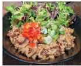
Beef Sukiyaki Fried Rice Bowl 775 Cal