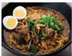
Spicy Beef Ramen 1125 Cal