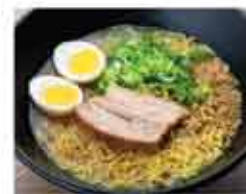
Goma Negi Shio Ramen 1095 Cal