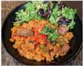
Spicy Beef Rice Bowl 925 Cal