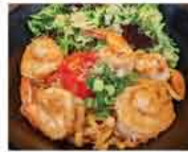
Crunchy Garlic Shrimp Noodles 1015 Cal