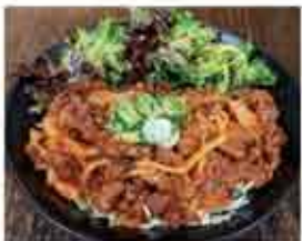
Umakara Beef Rice Bowl 855 Cal