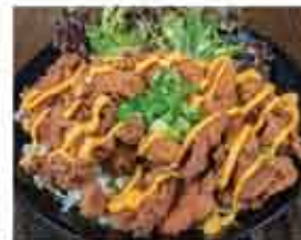
Fried Chicken Karaage Rice Bowl 895 Cal