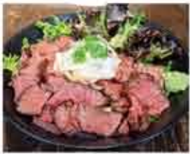
Roast Beef Rice Bowl 955 Cal

SIGNATURE RICE AND NOODLE BOWLS WITH MIXED GREENS, SERVED WITH MISO SOUP