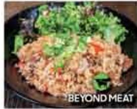
Beyond Beef Rice Bowl 695 Cal