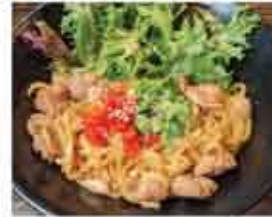
Garlic Shoyu Chicken Noodles 995 Cal