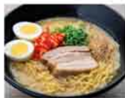
Tonkotsu Ramen 975 Cal