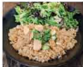
Garlic Fried Rice Bowl 695 Cal