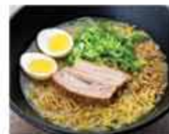
Goma Negi Shio Ramen 1095 Cal