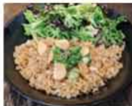
Garlic Fried Rice Bowl 695 Cal