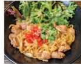
Garlic Shoyu Chicken Noodles 995 Cal