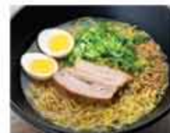
Goma Negi Shio Ramen 1095 Cal