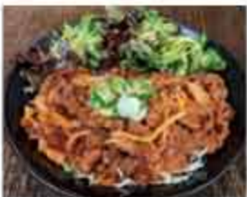
Umakara Beef Rice Bowl 855 Cal