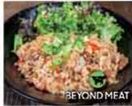
Beyond Beef Rice Bowl 695 Cal