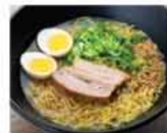
Goma Negi Shio Ramen 1095 Cal