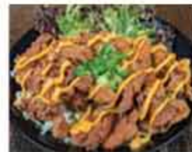
Fried Chicken Karaage Rice Bowl 895 Cal