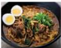
Spicy Beef Ramen 1125 Cal