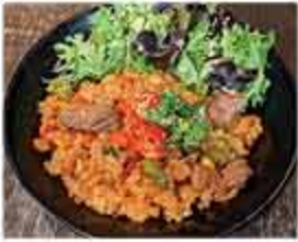
Spicy Beef Rice Bowl 925 Cal