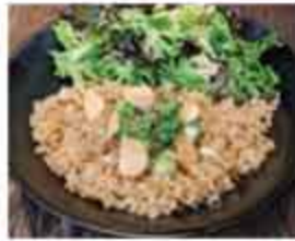
Garlic Fried Rice Bowl* 695 Cal