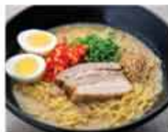
Tonkotsu Ramen 975 Cal