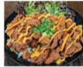
Fried Chicken Karaage Rice Bowl 895 Cal