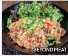
Beyond Beef Rice Bowl 695 Cal