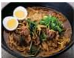
Spicy Beef Ramen 1125 Cal