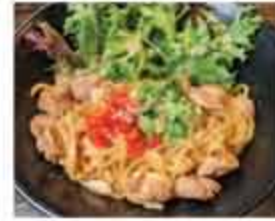
Garlic Shoyu Chicken Noodles 995 Cal