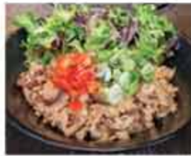
Beef Sukiyaki Fried Rice Bowl 775 Cal