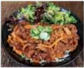
Umakara Beef Rice Bowl 855 Cal