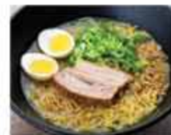
Goma Negi Shio Ramen 1095 Cal