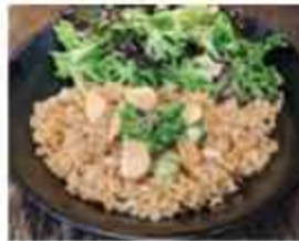
Garlic Fried Rice Bowl*