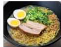
Goma Negi Shio Ramen 1095 Cal