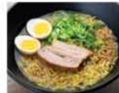
Goma Negi Shio Ramen 1095 Cal