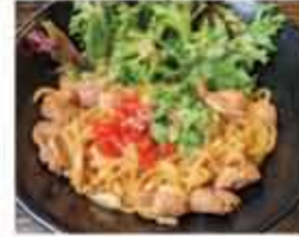
Garlic Shoyu Chicken Noodles 995 Cal