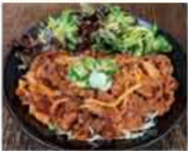
Umakara Beef Rice Bowl 855 Cal