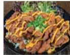
Fried Chicken Karaage Rice Bowl 895 Cal