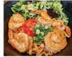
Crunchy Garlic Shrimp Noodles 1015 Cal