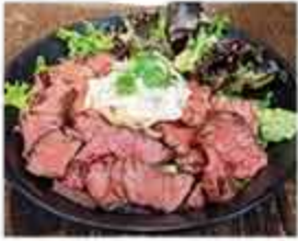
Roast Beef Rice Bowl 955 Cal

SIGNATURE RICE AND NOODLE BOWLS WITH MIXED GREENS, SERVED WITH MISO SOUP