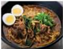
Spicy Beef Ramen 1125 Cal