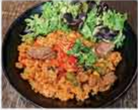
Spicy Beef Rice Bowl 925 Cal