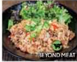
Beyond Beef Rice Bowl 695 Cal