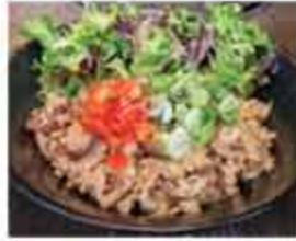
Beef Sukiyaki Fried Rice Bowl 775 Cal