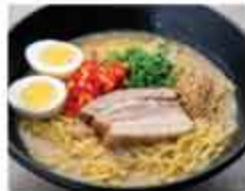
Tonkotsu Ramen 975 Cal