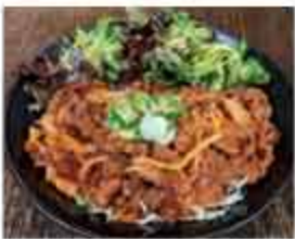
Umakara Beef Rice Bowl 855 Cal