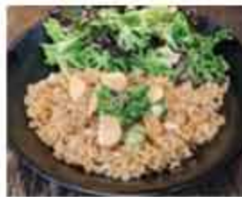
Garlic Fried Rice Bowl* 695 Cal