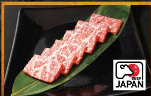
Japanese A5 Wagyu Striploin*