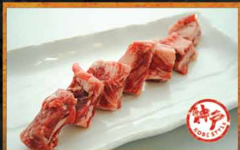
Kobe Style Rib Finger*

Marinade Choices: Sweet Soy Tare / Salt & Pepper