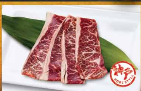
Kobe Style Kalbi Chuck*