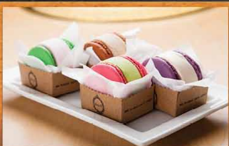
Macaron Ice Cream 1 pc