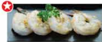
Shrimp 200–440 Cal