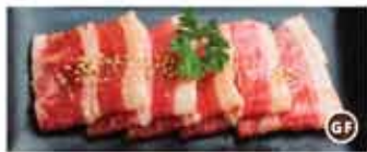
Toro Beef 250–520 Cal