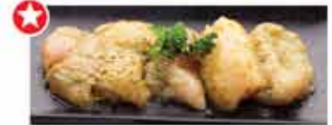
Chicken Breast 145–540 Cal