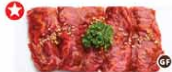
Harami Skirt Steak 275–560 Cal

Marinade Choices: Shio or Sweet Soy Tare