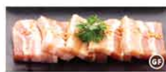
Pork Belly 510–1040 Cal

Marinade Choices: Garlic GF or Spicy Jalapeño Miso