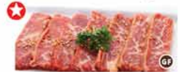
Prime Kalbi Short Rib 390–840 Cal