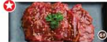
Bistro Hanger Steak 205–560 Cal