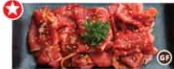
Yaki-Shabu Beef 205–460 Cal

Marinade Choices: Sweet Soy Tare or Shio