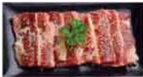
Kalbi Chuck Rib* Sweet Soy Tare 270 Cal