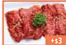
Harami Skirt Steak* Miso 280 Cal