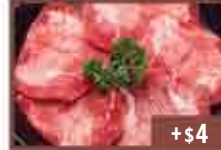
Beef Tongue* 3 oz w/ Lemon 190 Cal