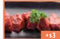
Filet Mignon* Salt & Pepper 250 Cal