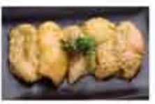
Chicken Breast* Basil / Teriyaki 270 Cal / 145 Cal