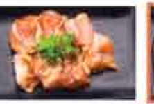
Garlic Shoyu Chicken Thigh* 130 Cal