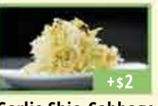
Garlic Shio Cabbage 60 Cal