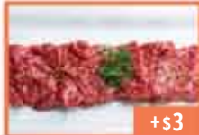
Premium Sirloin* Sweet Soy Tare 150 Cal