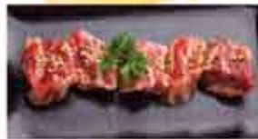
Angus Beef Rib* Sweet Soy Tare 240 Cal