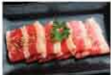
Toro Beef* Sweet Soy Tare 260 Cal