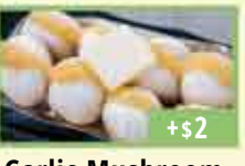
Garlic Mushroom 130 Cal