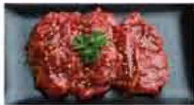
Bistro Hanger Steak* Miso 205 Cal