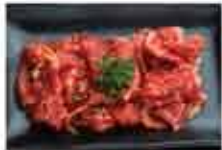
Yaki-Shabu Beef* Miso 205 Cal