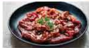
Umakara Ribeye* 160 Cal Try w/ Garlic Shio Cabbage!