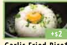
Garlic Fried Rice* 630 Cal