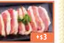
Duck Breast* Shio 180 Cal