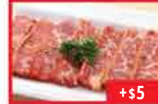
Prime Kalbi Short Rib* Sweet Soy Tare 420 Cal