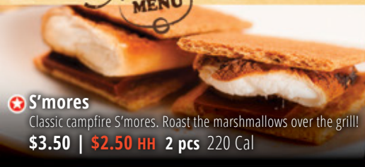
S'mores Classic campfire S'mores. Roast the marshmallows over the grill! $3.50 | $2.50 HH 2 pcs 220 Cal