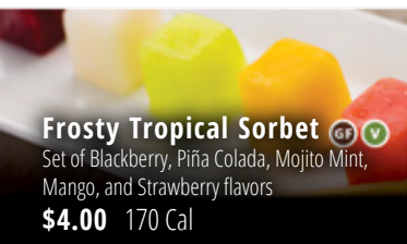
Frosty Tropical Sorbet Set of Blackberry, Piña Colada, Mojito Mint, Mango, and Strawberry flavors $4.00 170 Cal