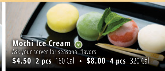
Mochi Ice Cream Ask your server for seasonal flavors $4.50 2 pcs 160 Cal • $8.00 4 pcs 320 Cal