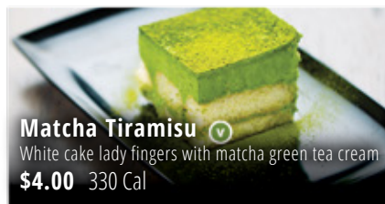
Matcha Tiramisu White cake lady fingers with matcha green tea cream $4.00 330 Cal