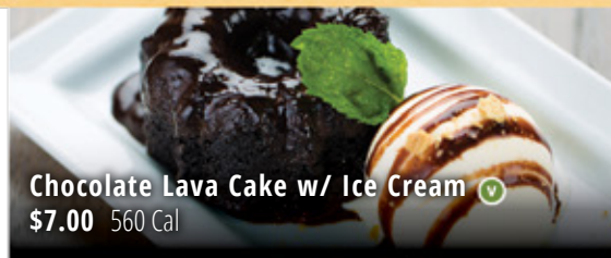
Chocolate Lava Cake w/ Ice Cream $7.00 560 Cal