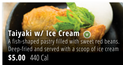
Taiyaki w/ Ice Cream A fish-shaped pastry filled with sweet red beans. Deep-fried and served with a scoop of ice cream $5.00 440 Cal