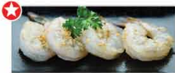
Shrimp 200–440 Cal