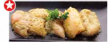
Chicken Breast 145–540 Cal