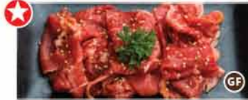
Yaki-Shabu Beef 205–460 Cal

Marinade Choices: Sweet Soy Tare or Shio