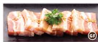
Pork Belly 510–1040 Cal

Marinade Choices: Garlic GF or Spicy Jalapeño Miso