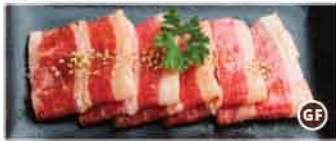
Toro Beef 250–520 Cal