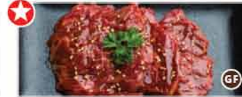
Bistro Hanger Steak 205–560 Cal