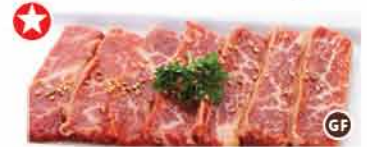
Prime Kalbi Short Rib 390–840 Cal