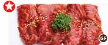
Harami Skirt Steak 275–560 Cal

Marinade Choices: Shio or Sweet Soy Tare