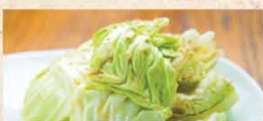
ADDICTING CABBAGE SALAD

Sliced cabbage w/ traditional savory Japanese dressing