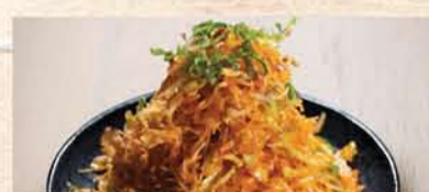
SPICY CABBAGE SALAD

Refreshing mix of shredded cabbage, crunchy garlic, green onions, sesame seeds, and shio white soy sauce