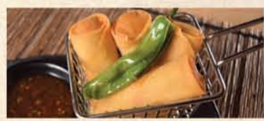
VEGETABLE SPRING ROLLS

Mix of vegetables rolled in a light wonton wrapper and fried Served w/ sweet chili sauce and shishito pepper