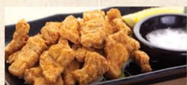
FRIED BACON CHIPS

Pork belly slices fried to a yummy crunch