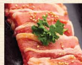
TORO BEEF TARE SWEET SOY*