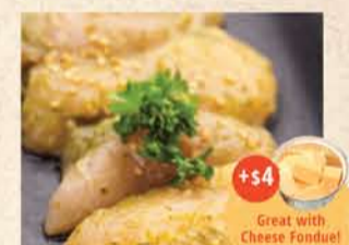
CHICKEN THIGH BASIL*