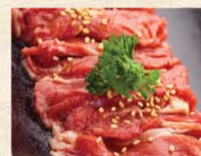
YAKI-SHABU TARE SWEET SOY*

REG. = REGULAR PRICE ($) HH = HAPPY HOUR PRICE ($) SUPER HAPPY HOUR PRICE ($)