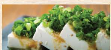
SHIO NEGI TOFU

Cold tofu topped w/ white soy, sesame oil sauce, and scallions