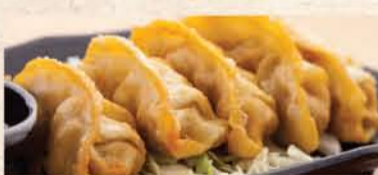
FRIED PORK DUMPLINGS

Fried dumplings w/ juicy ground pork filling served w/ ponzu citrus dipping sauce