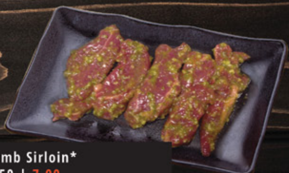
Lamb Sirloin* 8.50 | 7.00 Marinade: Basil