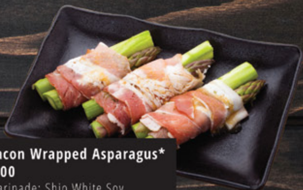
Bacon Wrapped Asparagus* 7.00 Marinade: Shio White Soy