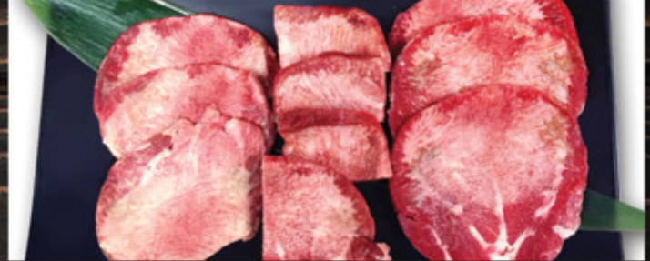
Beef Tongue Sampler* Premium Beef Tongue, Thick Cut Beef Tongue, and Beef Tongue 17.00 Try with Lemon