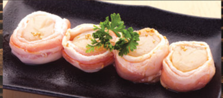
Bacon Wrapped Scallops* Thinly sliced bacon wrapped around scallops 10.00 Marinade: Shio White Soy