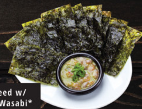
Seaweed w/ Tako Wasabi* 7.00