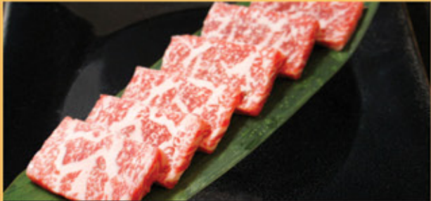
Japanese Wagyu* A premium grade meat imported from Japan! 60.00 Seasoning: Salt & Pepper