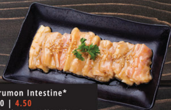
Horomon Intestine* 5.50 | 4.50 Marinade: Miso / Shio White Soy