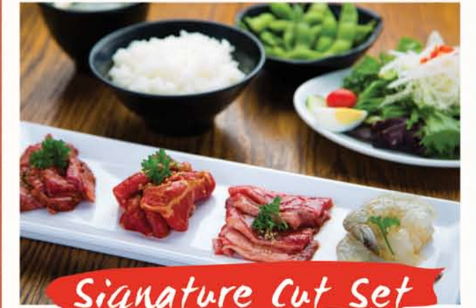
Signature Cut Set

Bistro Hanger Steak Miso 2oz Garlic Shoyu Rib Eye 2oz Spicy Yaki-Shabu Beef 2oz Toro Beef Tare Sweet Soy 2oz