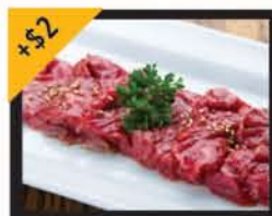
UPGRADE Premium Sirloin