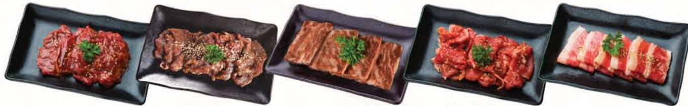
Bistro Hanger Steak Miso

W/ SMALL GYU-KAKU SALAD, MISO SOUP & RICE