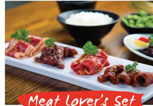
Meat Lover's Set