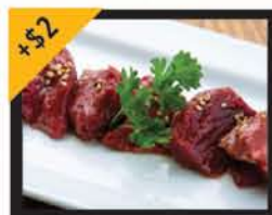
UPGRADE Filet Mignon