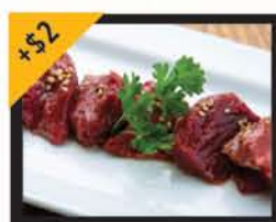
UPGRADE Filet Mignon