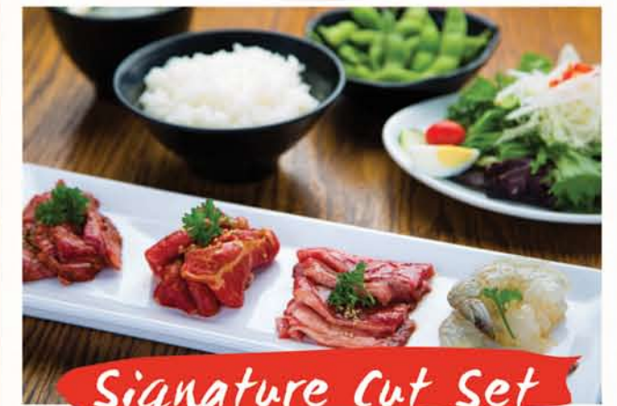
Signature Cut Set

Bistro Hanger Steak Miso 2oz Garlic Shoyu Rib Eye 2oz Spicy Yaki-Shabu Beef 2oz Toro Beef Tare Sweet Soy 2oz