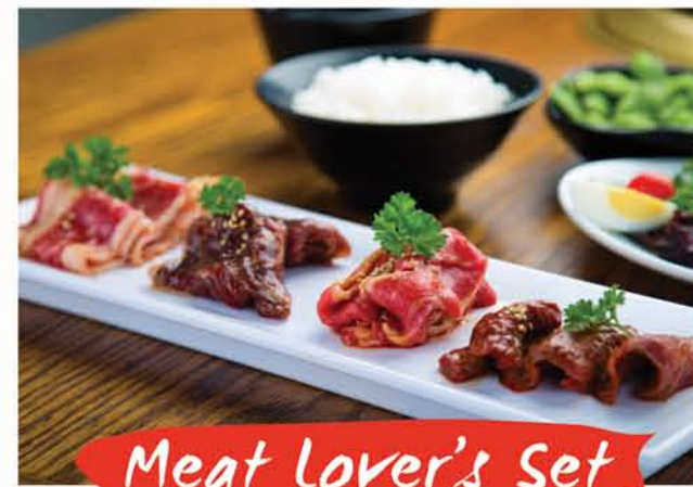
Meat Lover's Set