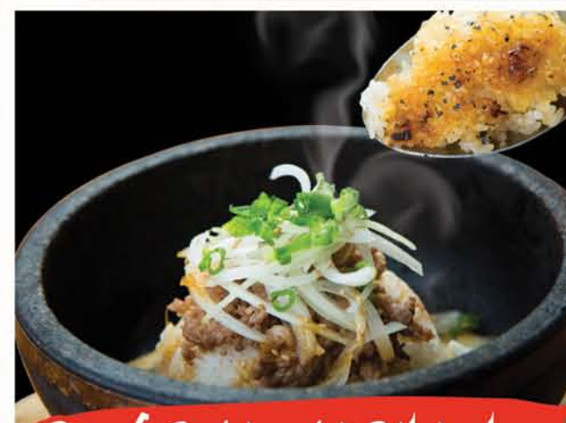
Beef Sukiyaki Bibimbap