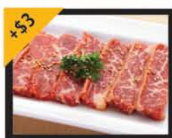
UPGRADE Prime Kalbi Short Rib Tare Sweet Soy