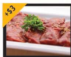
UPGRADE Harami Miso Skirt Steak