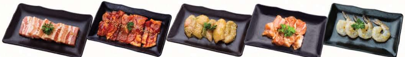
Pork Belly Shio White Soy