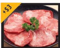
UPGRADE Beef Tongue