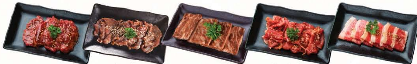
Bistro Hanger Steak Miso

W/ SMALL GYU-KAKU SALAD, MISO SOUP & RICE