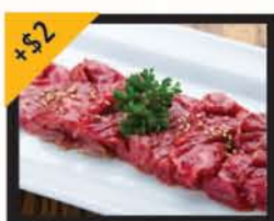
UPGRADE Premium Sirloin