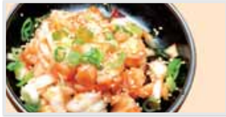
Shrimp Poké 海老ポケ $7.95 → $4.98