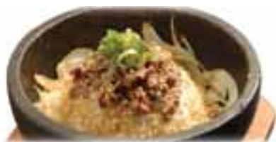
Sukiyaki Bibimbap すき焼きビビンバ $7.95 → $4.98