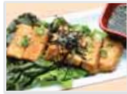
Fried Japanese Tofu 揚げ豆腐 $4.95 → $2.98