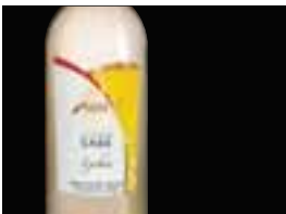
Hana Fruit Sake Lychee / Fuji Apple $24 720ml $6.95 glass