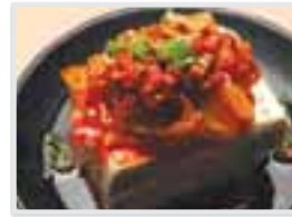
Spicy Cold Tofu スパイシー冷や奴 $3.95 → $2.48