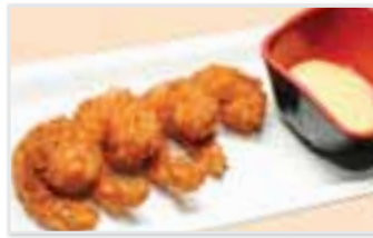
Panko Breaded Shrimp エビフライ $7.95 → $4.98