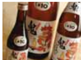
Demon Slayer +3 MICHINOKU ONIKOROSHI Known for its dry & brisk flavors; well-rounded, it complements a wide variety of dishes $90 1800ml $45 720ml $22 300ml $8 glass