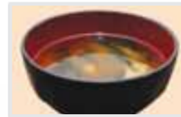
Miso Soup お味噌汁 $3.95 → $2.98