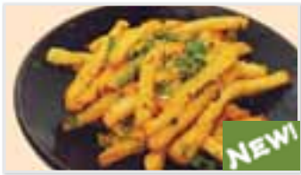
Garlic Fries ガーリックポテト $5.95 → $2.98