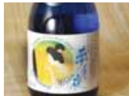
Dreamy Moon +4 YUME TSUKIYO Made with super premium rice "Matsuyamamimi", this sake is clean, light & refreshing; goes exceptionally well with seafood $85 720ml $30 300ml