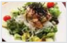
Spicy Tuna Avocado Salad (half) スパイシー・ツナ・アボカドサラダ(半) $4.95 → $3.98