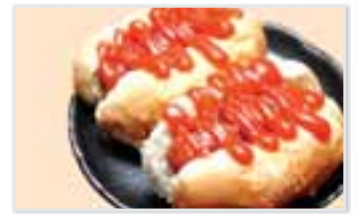
Sausage Sliders ホットドッグ $7.95 → $3.98