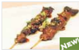
Hanger Steak Miso Skewers 牛さがり串焼き $5.95 → $3.98