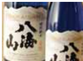
Eight Peaks +5 HAKKAISAN TOKUBETSU JUNMAI Velvety yet crisp flavors; compliments light to medium flavored dishes $115 1800ml $65 720ml $25 300ml $11 glass