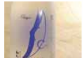
Shochikubai Premium Glnjo +5 Clean & grassy aroma with vanilla, nectarine & fruity flavors $16 300ml