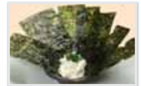
Crispy Seaweed w/ Cream Cheese 韓国海苔&クリームチーズ $3.45 → $1.73 $1.95 for Crispy Seaweed Only