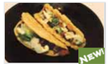
Spicy Pork Tacos スパイシーポーク・タコス $4.95 → $2.98