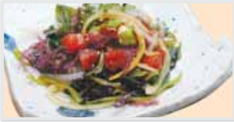
Hawaiian Ahi Poké ハワイアン・アヒポケ $7.95 → $4.98