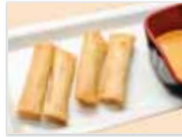
Veggie Spring Roll 野菜の春巻き $7.95 → $4.98