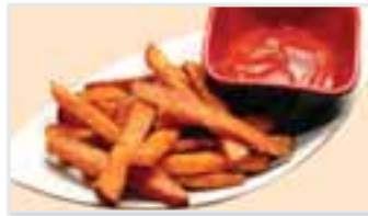
Sweet Potato Fries さつま芋揚げ $5.95 → $2.98