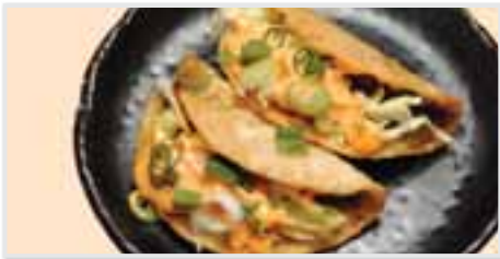
BBQ Tacos バーベキュー・タコス $4.95 → $2.98