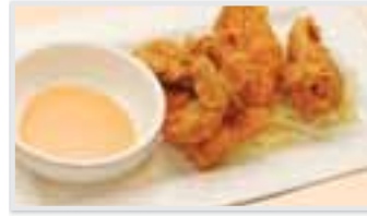
Fried Chicken Karaage 鶏の唐揚げ $5.95 → $2.98