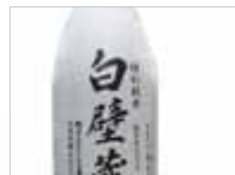
The White Label +2 SHIRAKABEGURA Brewed in small batches, fermented unhurriedly at low temperatures, this sake is clean & smooth $100 1800ml $42 720ml $21 300ml $7 glass