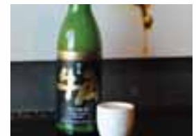
Crazy Milk -20 GYU-KAKU NIGORI SAKE Special drink for capping off a perfect meal; compliments spicy food $48 1500ml $24 750ml $12 → $7 375ml $5 glass