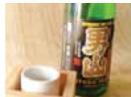
Man's Mountain +14 OTOKOYAMA The extremely sharp flavors accentuates any type of dish $100 1800ml $45 720ml $22 300ml $8 glass