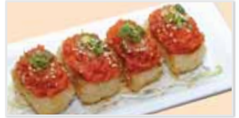
Spicy Tuna Volcano スパイシーツナ・ボルケーノ $6.95 → $4.98