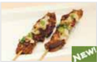
Filet Mignon Skewers 牛フィレ串焼き $5.95 → $3.98