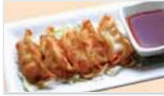
Pork Gyoza Dumplings 餃子 $4.95 → $2.98