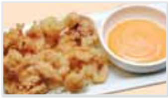
Fried Calamari イカ唐揚げ $5.45 → $3.95