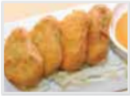
Fried Tofu Nuggets 豆腐ナゲット $4.95 → $2.98