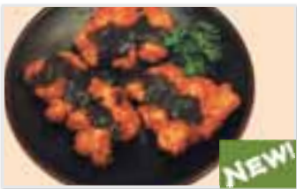
Chicken Katsu チキンカツ $7.95 → $4.98