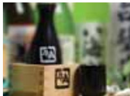
Hot Sake $7.95 → $5 300ml