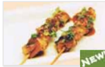
Chicken Teriyaki Skewers チキン串焼き $4.95 → $2.98