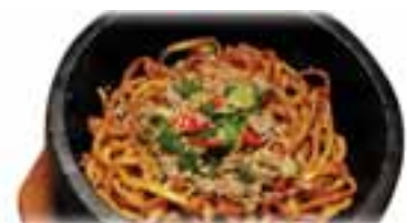
Garlic Fried Noodles ガーリックヌードル $7.95 → $4.98