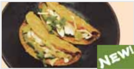
Spicy Tuna Tacos スパイシーツナ・タコス $5.95 → $3.98