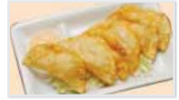
Cheese Wontons チーズワンタン揚げ $4.95 → $2.98