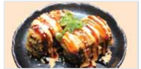
Firecracker Roll ファイアークラッカー巻き $7.95 → $3.98