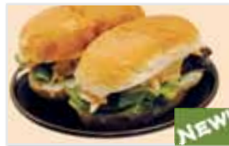
Hanger Steak Sliders ハラミドッグ $7.95 → $4.98