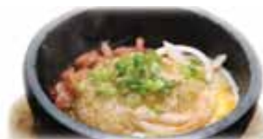
Staff's Favorite Bibimbap スタッフおすすめのビビンバ $7.95 → $4.98