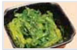
Seaweed Salad ワカメサラダ $3.95 → $1.98