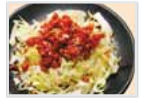
Spicy Cabbage Salad 牛角風食べるラー油サラダ $2.95 → $1.48