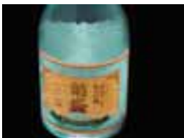
Crysanthemum Mist +1 KIKUSUI Made with an exquisitely white Gohyakumangoku rice, this sake produces elegant aroma with a very light palate $110 1800ml $52 720ml $21 300ml $9 → $2 shot