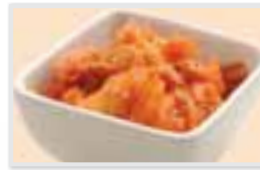
Kim-Chee キャベツキムチ $3.95 → $1.98