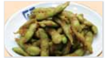
Edamame Garlic Soy Infusion 枝豆インフュージョン $4.45 → $2.98