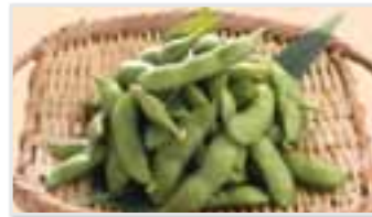
Edamame 枝豆 $3.45 → $1.98